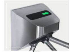
"Open/Closed" light indicators