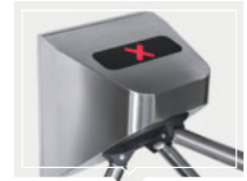
"Open/Closed" light indicators

The warranty period is 5 (five) years from the date of sale of the product.